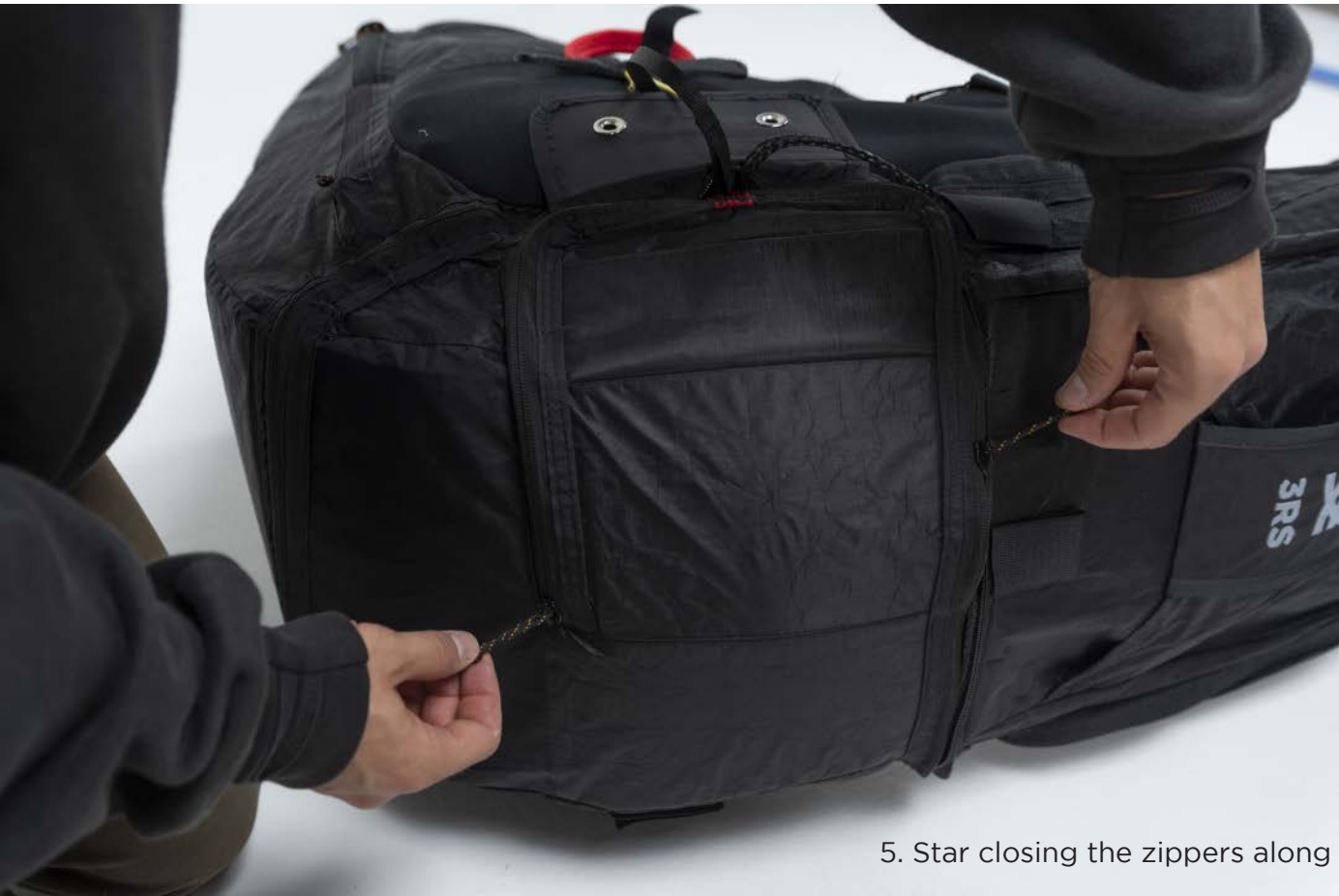
5. Start closing the zippers along the routing.